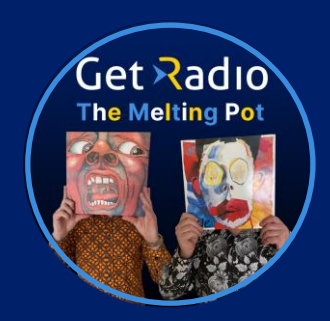
The Melting Pot Thursdays – 7pm

Get all the latest music as Teddy plays an hour of the biggest and best new tracks, keeping you up to date with all the new releases you need to know about.